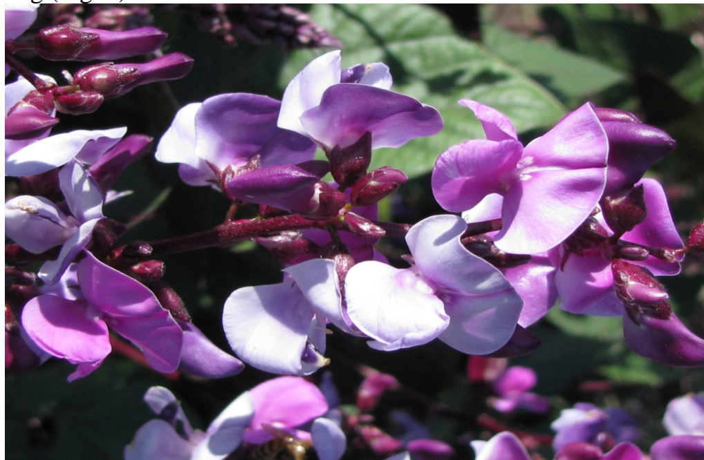
Fig. 1 – The mass flowering of dolichos plants

It was determined that the duration of the period from the germination till the beginning of flowering during the different schemes of sowing was between 39 to 41 days. Early-ripening was characterized the variety with the biggest density of sowing (71 thousands pcs./ha), which had a duration of the period 39 days that is 2 days less than control. Unripe beans-blades in a phase of technical maturity have beautiful burgundy color. Dolichos differs by long term of flowering with beautiful purple flowers from June until autumn frosts. All this suggests the possibility of their use in gardening (Fig. 1).